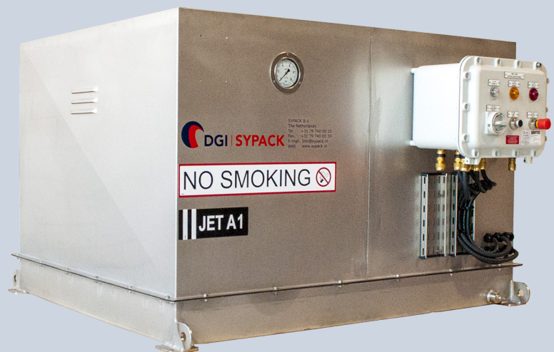
Rental pump skid

Our rental fleet includes a number of high quality, compact, air freight able, easy to install pump and dispenser skids. Available systems are fully compliant with CAP 437 and both DNV and ABS regulations. Please contact our office for availability of our rental systems.