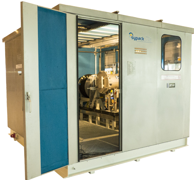
Walk in dispenser skid

A majority of offshore operators prefer Jet fuel to be supplied using regular platform supply vessels, this requires fuel to be transported in certified transportable fuel tanks. This method of transportation minimizes the risk of fuel contamination and fuel spillage during offloading to the platform. Whilst on board the platform, the tanks will be hoisted into our systems to prevent movements and create the required earth bonding and fire protection by means of a jettison platform or deluge lines integrated into the laydown skid. Tanks can be coupled to a 100% redundant pump skid using a flexible hose in order to transfer Jet fuel toward the dispenser skid near the helideck. Fuel quantity and quality is monitored through a positive displacement flow meter and an API-certified three-stage-filter-vessel, which separates and prevents any water particles from entering the helicopter during refueling. Other safety features include a positive grounding monitor to prevent buildup of static electricity and a system shutdown in case the helicopter departs during refueling.