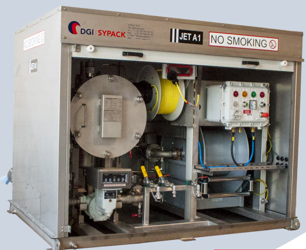
Rental Dispenser skid